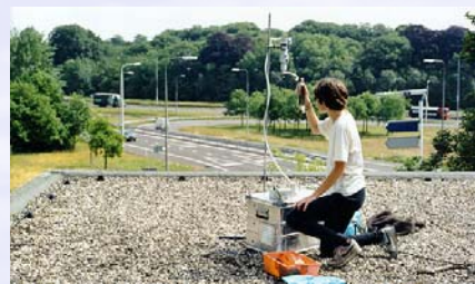
Air pollution measurement at the roof of a school near a major motorway