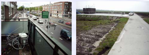
Contrast in exposure to (traffic-related) air pollution

The starting point for the report is relevant research funded by E.C. FP4 and FP5.